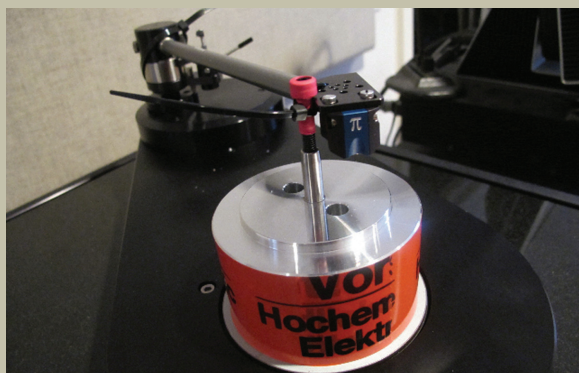
Brinkmann's 9.6 tonearm and Pi cartridge.

But don't even think about it. In short, what the 9.6 lacks in bells and whistles it made up for in the excellence of its machining and construction. The 9.6 tonearm is a very well made, basic design, but at $3990 it faces some stiff competition for not that much more money—competition that offers greater functionality, perhaps with greater dynamic capabilities and more precise extraction of information from the grooves.